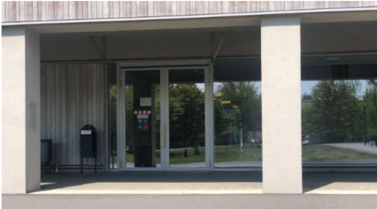
Image 4: Entrance to the building_ Image source: Freie Universität Berlin

Take the entrance marked in black (see image 2). You will need to walk about 100 meters along the building (see image 4). Then go through the entrance and walk to the middle of the building and take the middle stairs/elevator.