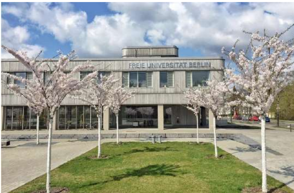
Image 1: Holzlaube ("wooden cottage")

The conference rooms (from room - 1.2009 in the basement to room 2.2059 on the 2nd floor) are located in the Holzlaube ("wooden cottage"). The Holzlaube is located on the Dahlem campus, Fabeckstr. 23-25 (see image 2) and looks like this: