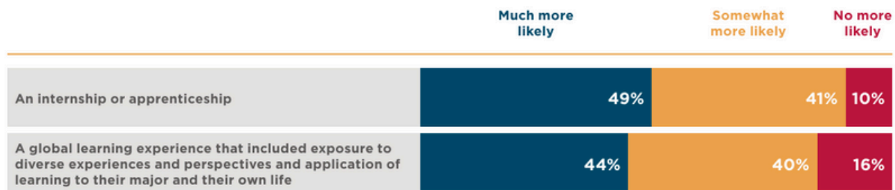
Source: Association of American Colleges and Universities (AAC&U), How college contributes to workforce success: Employer views on what matters most (2021, p. 10).

Internships and international experience are what make employers ‘much more likely to consider’ hiring a candidate. With FU-BEST Internship you combine both!